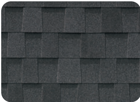
Black Shadow IR