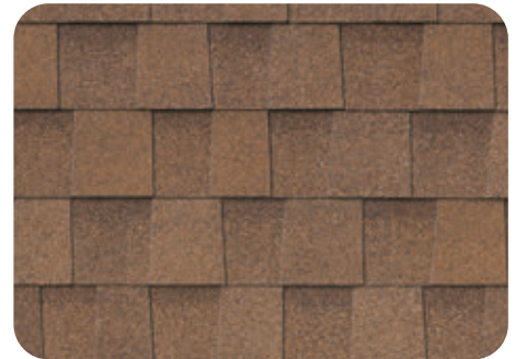
Desert Shake IR