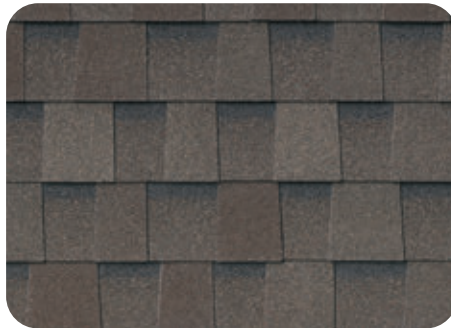
Weathered Wood IR