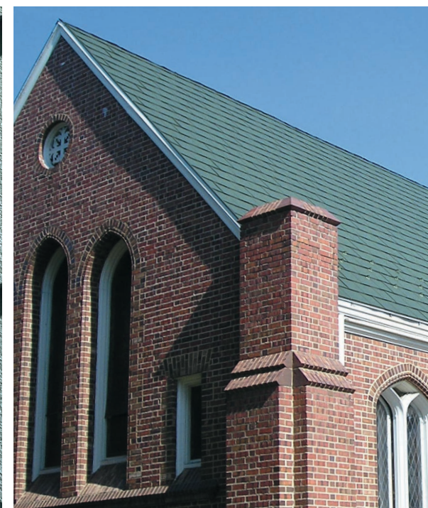
StoneCrest® Tile Quaker Green

Create the distinctive look of smooth, uniform tile. For those who appreciate a contemporary and refined appearance.