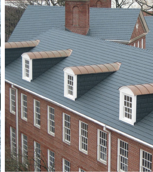
StoneCrest® Slate Vermont Blue

Create a dramatic look that closely replicates the random finish of natural slate. The double-stamped manufacturing process creates stunning beauty.