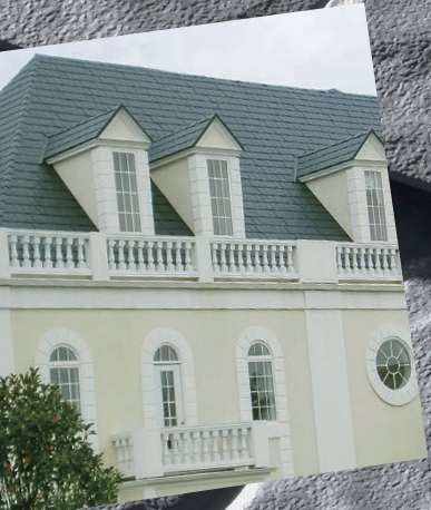
StoneCrest Slate Sierra Slate Grey

Striking Modern Appeal. Rated by the Cool Roof Rating Council® CRRC.