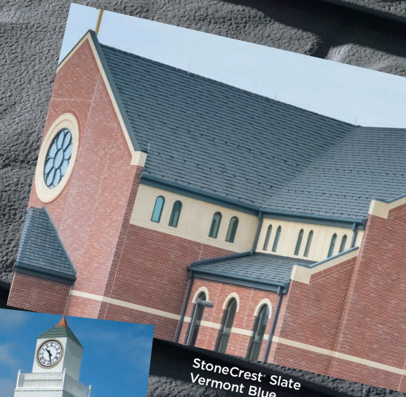
StoneCrest Slate Vermont Blue