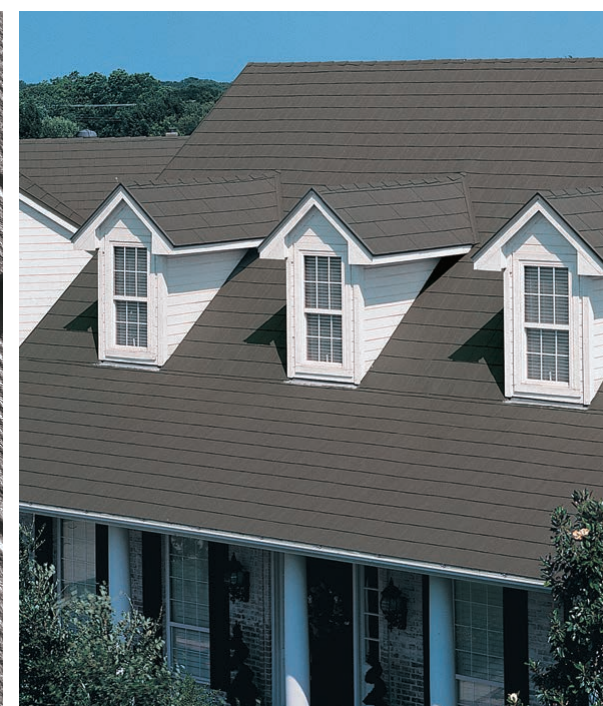
AstonWood Timber Brown

Combine the warmth and look of cedar shingles with galvanized steel to produce a roofing product that replicates the rich look of wood.