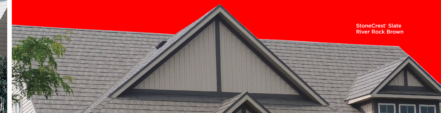
StoneCrest® Slate River Rock Brown

Used for application under metal roofs, this self-adhering underlayment has a rubberized asphalt, polymer film surfacing and a treated release film. Surface is textured for skid resistance.