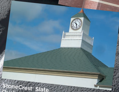
StoneCrest Slate Quaker Green

MetalWorks® steel shingles are a beautiful choice for a wide range of residential and commercial applications.